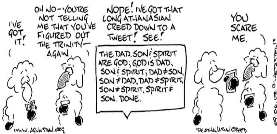
"Agnus Day appears with the permission of www.agnusday.org"