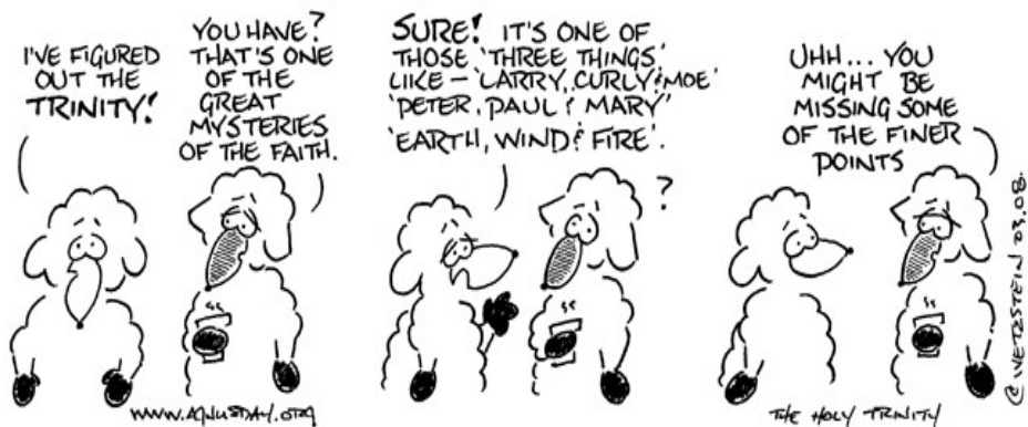
"Agnus Day appears with the permission of www.agnusday.org"