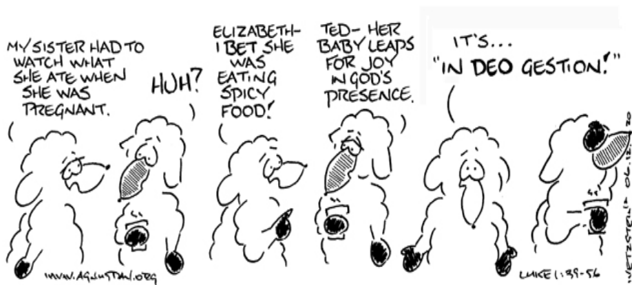
"Agnus Day appears with the permission of www.agnusday.org"