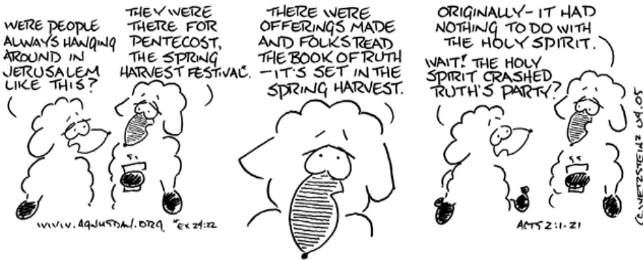
"Agnus Day appears with the permission of www.agnusday.org"