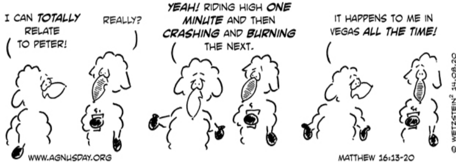
"Agnus Day appears with the permission of www.agnusday.org"