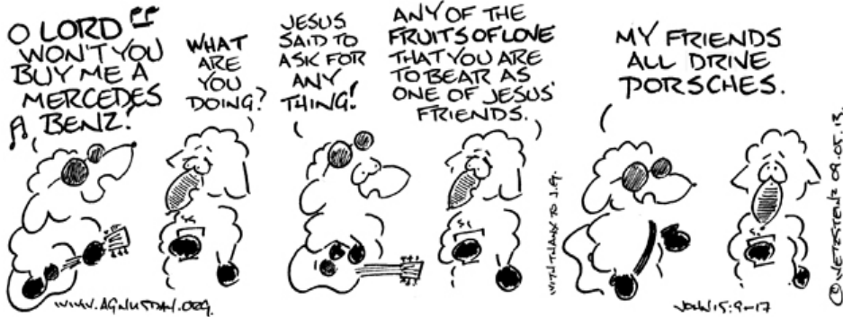
"Agnus Day appears with the permission of www.agnusday.org"