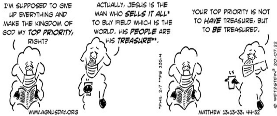
"Agnus Day appears with the permission of www.agnusday.org"