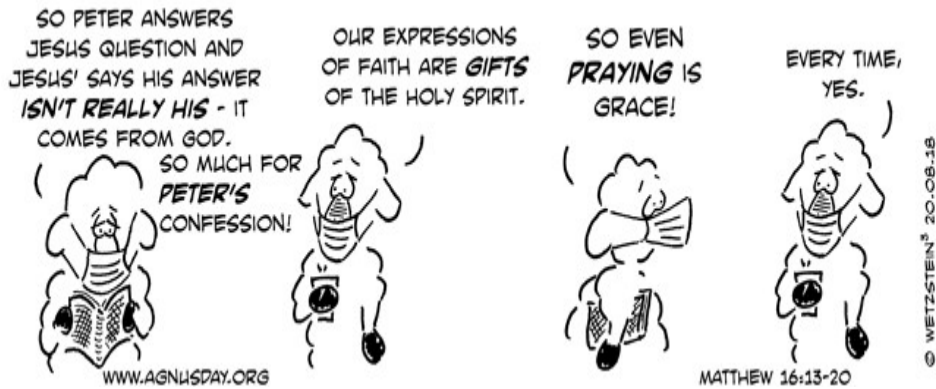
"Agnus Day appears with the permission of www.agnusday.org"